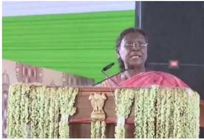
GORAKHPUR, JULY 1

President Droupadi Murmu while inaugurating the Mahayogi Gurukul Gorakhnath AYUSH University here on Tuesday said this is a milestone in the development of medical education and medical services, not only in Uttar Pradesh but also in the entire country.