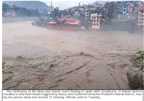
The confluence of the Beas and Suketi rivers flowing in spate after cloudburst, in Mandi district, Himachal Pradesh's Mandi district, leaving one person dead and around 12 missing, officials said on Tuesday.

The President noted that the popularity of medicine based on AYUSH systems is increasing. She said the Mahayogi Gurukul Gorakhnath AYUSH University could play a major role in increasing the popularity of AYUSH systems further.