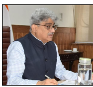
BPCL, CVVPL, NHAI and others.

The meeting witnessed participation from Additional Chief Secretary, Higher Education; Principal Secretary, Finance; CMD, J&K Bank; Commissioner Secretary, Industries & Commerce; Secretary, Skill Development Department (SDD); Director General, Budget; Directors of SDD and I&C (Jammu/Kashmir) and senior representatives from leading public and private sector enterprises including SIDBI, NHP, TCS, IOCL, HPCL,